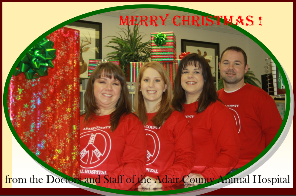
from the Doctors and Staff of the Adair County Animal Hospital